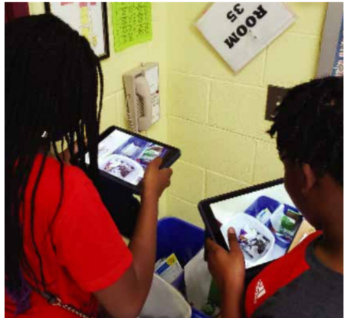
Recycling Survey at Bridgeway Elementary

K-Kids students engaged in data collection in the first part of the school year. They completed a recycling audit of all the recycling bins in the building, observing tissues, food, plastic bags, Styrofoam, and plastic utensils in nearly all the bins. They also sent out a waste and recycling survey for students and staff. The results of the audit and survey guided the students as they created videos and posters about recycling in their school. Students also completed a cafeteria waste audit, focusing on the amount of food waste and single use plastics thrown away. The K-Kids learned that a lot of food was thrown away in the cafeteria.